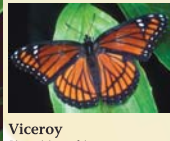
Viceroy Limnitis archippus