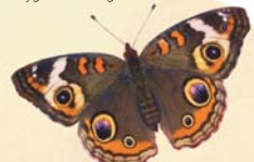
Common Buckeye Junonia coenia Larval host plants include: False Foxglove, Twinflower, Carolina Wild Petunia