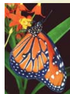
Queen Danaus gilippus Larval host plants include: White Swamp Milkweed, Butterflyweed