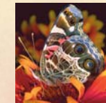
American Painted Lady Vanessa virginensis