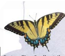
Eastern Tiger Swallowtail Papilio glaucus Larval host plants include: Wild Cherry