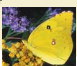
Southern Dogface Zerene cesonia Larval host plants include: Bastard Indigo, Summer Farewell